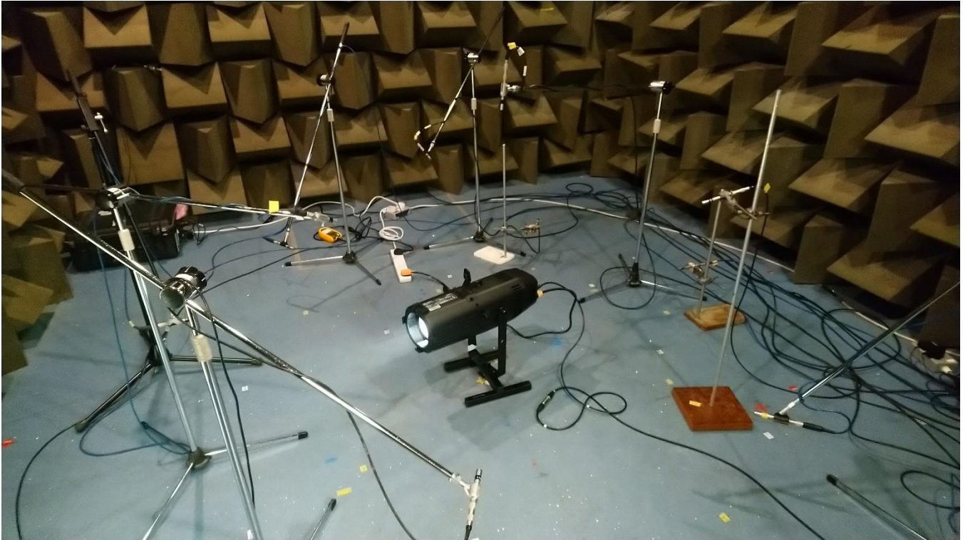
Figure 1 – unit under test mounted in the hemi-anechoic chamber at the University of Salford.