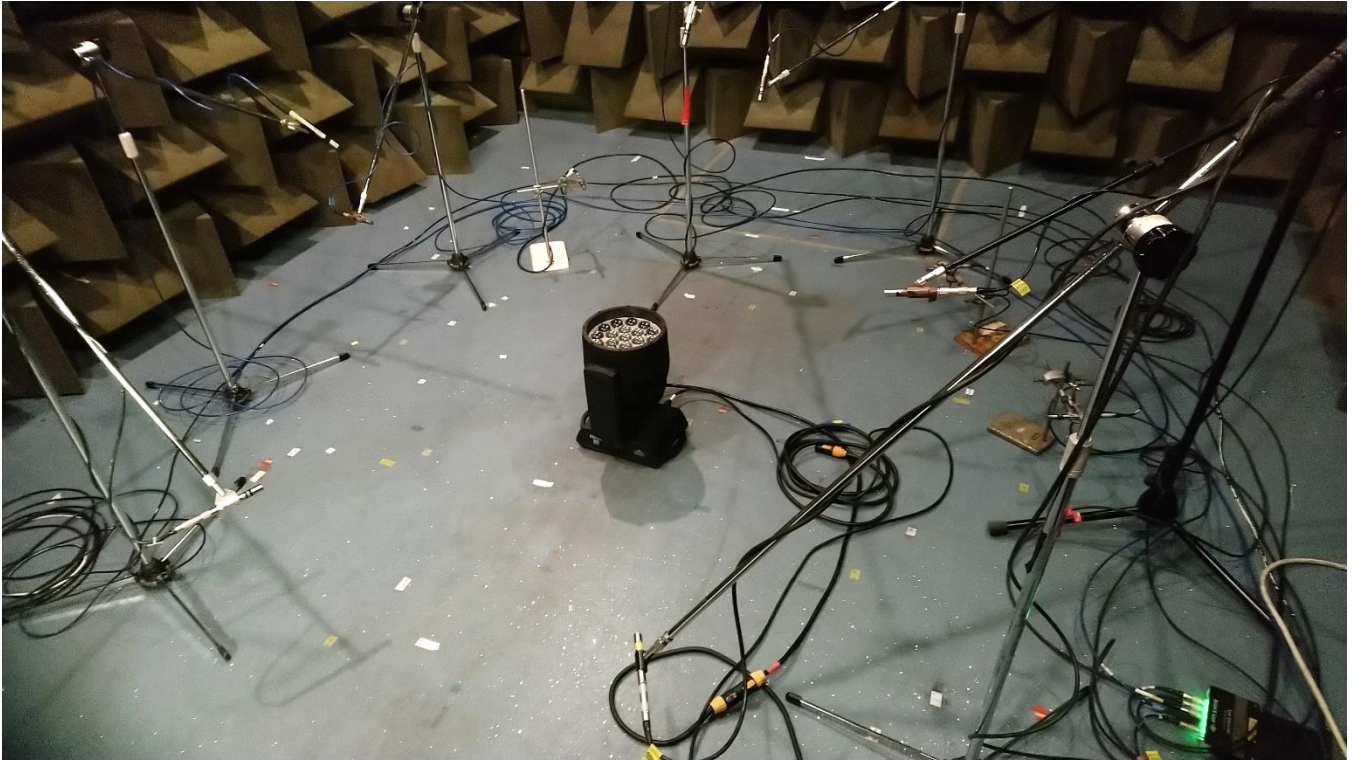
Figure 1 – unit under test mounted in the hemi-anechoic chamber at the University of Salford.